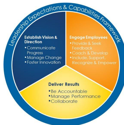
Figure 2 – Leadership Expectations & Capabilities Framework