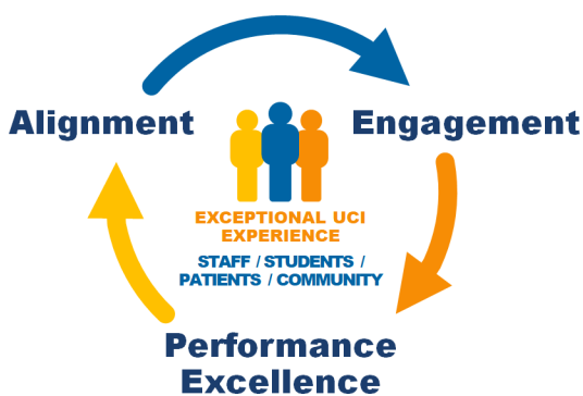
Figure 1 – Pathway to a high performance culture

A leadership framework and development programs have been designed to help leaders enable the workforce and organizational culture that UCI needs to reach its aspired heights. The framework establishes expectations for all leaders across UCI: establish vision and direction, engage employees, and deliver results. The development programs focus on building nine capabilities that leaders at their respective levels will need to live into these new expectations.